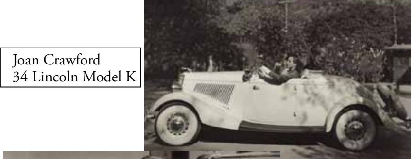
Joan Crawford 34 Lincoln Model K