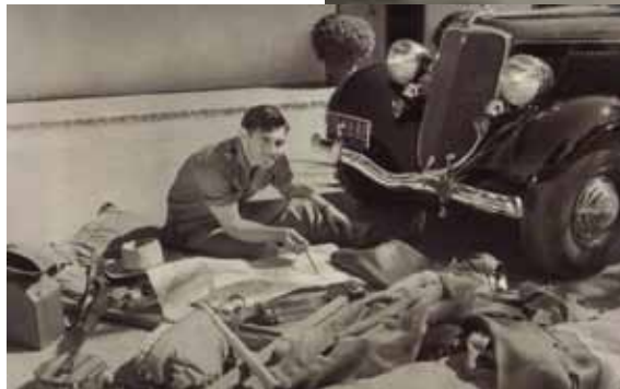
Clark Gable 34 Ford Roadster