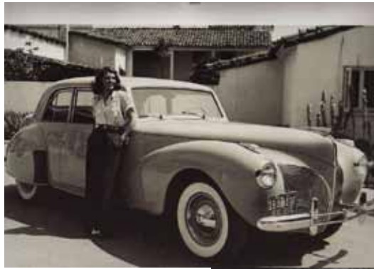
Rita Hayworth & 41 Lincoln Continental