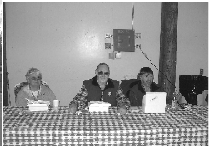
Three unsung heroes dining in Swap Meet elegance.