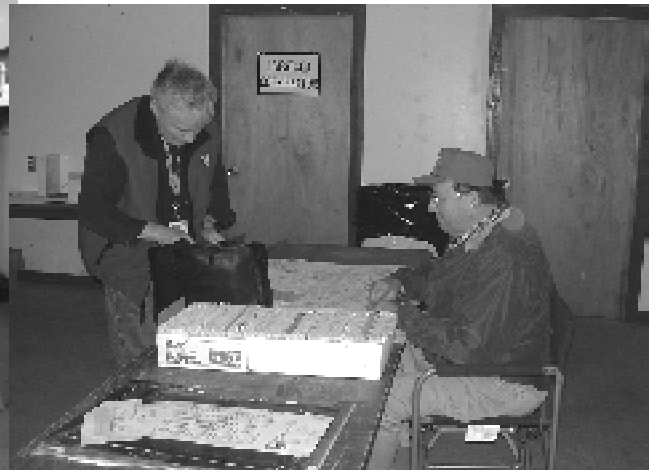
The sign says it all....