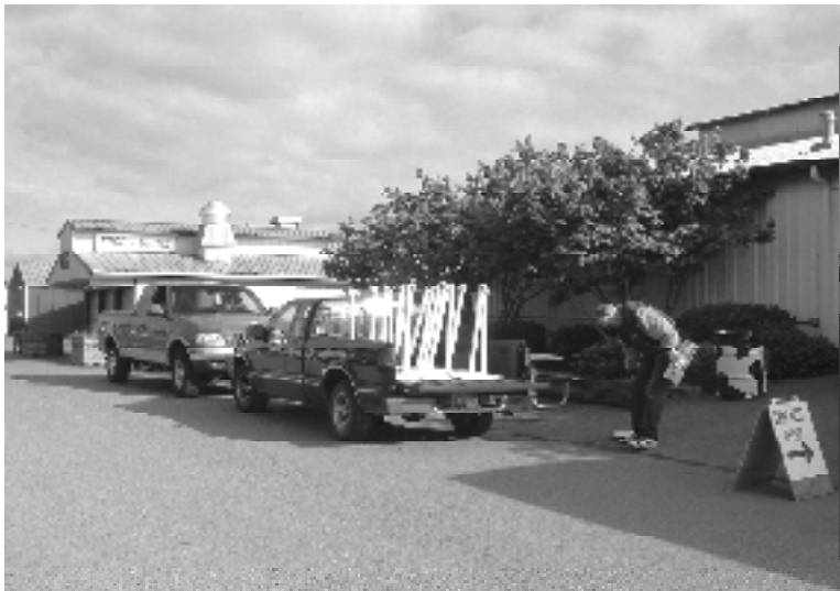
I could swear I left my truck right here.