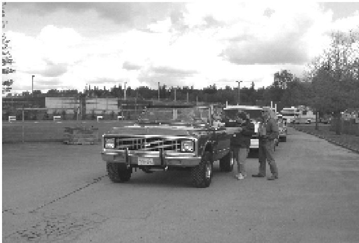
You're in the wrong line.