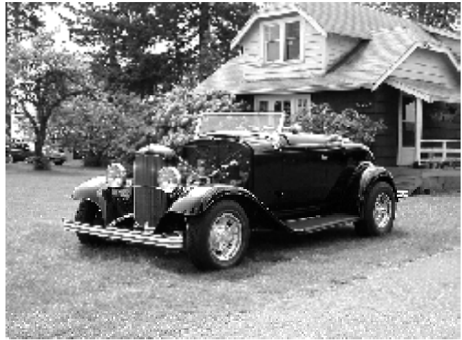
The Finished Product!

and 2 x 2 intake, Stromberg 97s, Mallory point type ignition, lightened flywheel, Tatom headers and stainless steel exhaust system, '39 transmission with '41 Lincoln Zephyr gears, '40 banjo rear end with 3.54 gears but modified axle housings that use 9" Ford axles, bearings and brakes, dropped '32 front axle with disk brakes. I choose Halibrand wheels. While I wanted to have a '50's hotrod look I was unwilling to carry that to the extreme of using sub standard brakes, steering and tires. I retained the '52 Pontiac taillights. Major work done by others: Sandblasting at Sandblasters Inc, engine by Tatom, pinstriping by Dick Erickson , tuck and roll by Deb Odinrider . I have had help from many club members, especially Bill Steil and Gary Duff but I have done most of the work myself.