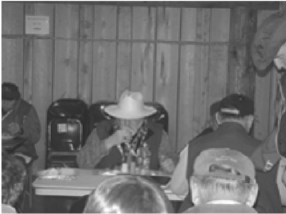
Where do you suppose he parks his tractor?