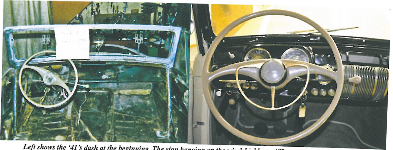
Left shows the '41's dash at the beginning. The sign hanging on the windshield says "Happy New Year - 1989." Also, note the glass of champagne sitting just outside the windshield. Left picture shows that beautiful dash today.