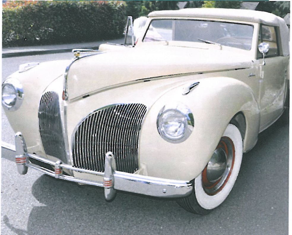
Picture above shows the car as it is being prepared for paint. Below is that same front today.