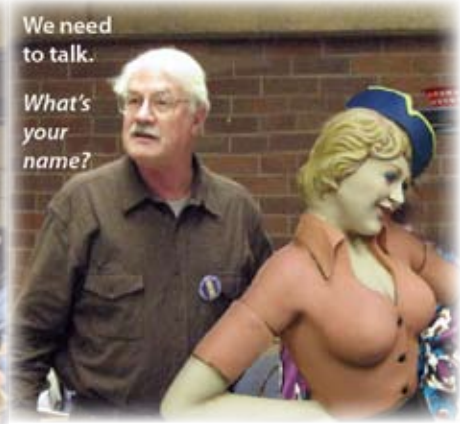
We need to talk.