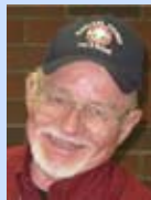
What's your name?