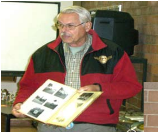
Bill Steil shared photos of past PSRG events and members